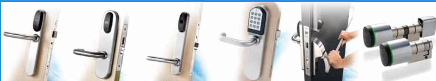
European and DIN escutcheons

SALTO Systems deliver all this and more. By providing a complete integrated access security solution we enable end users to ‘get more value from their users smart cards’ and create totally keyless buildings that are smart to own, operate and manage in a reliable wire-free environment.