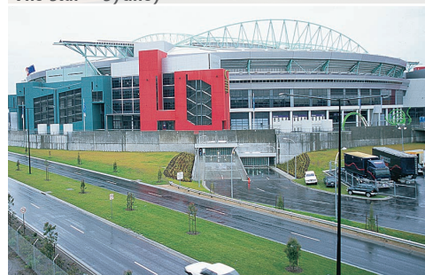
Etihad Stadium – Melbourne