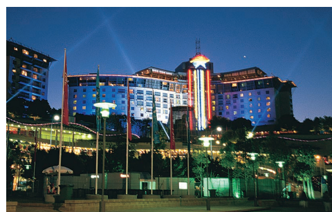
The Star – Sydney

P.O. Box 47169, Trentham, Upper Hutt Phone +64 272 875 625 Fax +64 4 970 2355 peterh@alco.net.nz www.alco.net.nz